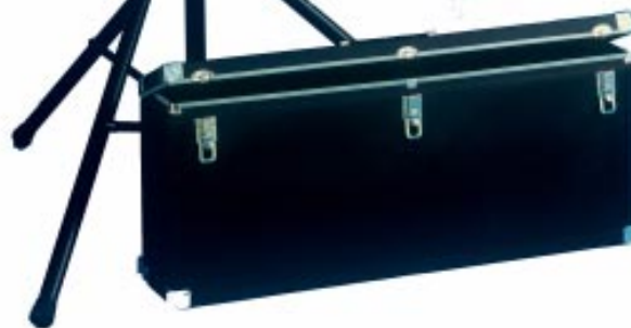
Figure 4 (Carrying Case)