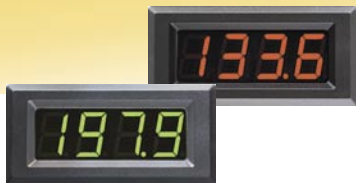
3 1/2 Digit - Standard LED