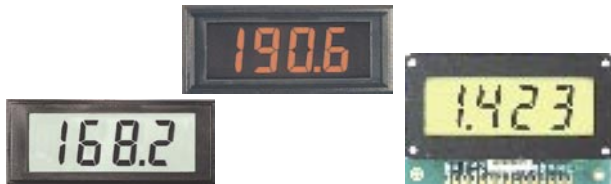
3 1/2 Digit - LCD Panel Meters