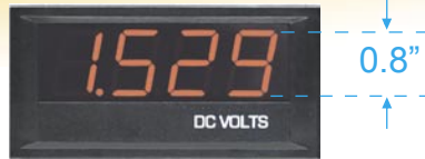
3 1/2 Digit - Big Digit LED